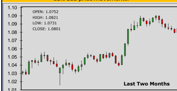
EUR/USD price movements: