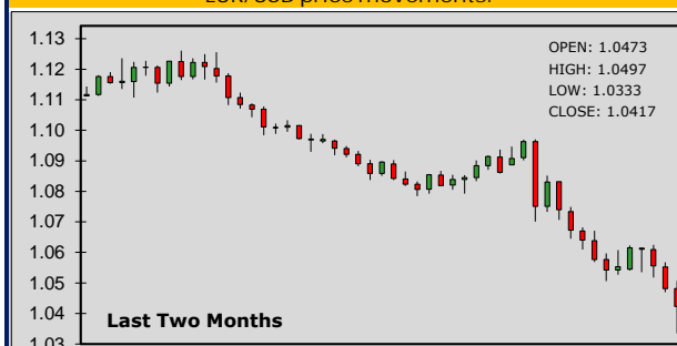
EUR/USD price movements: