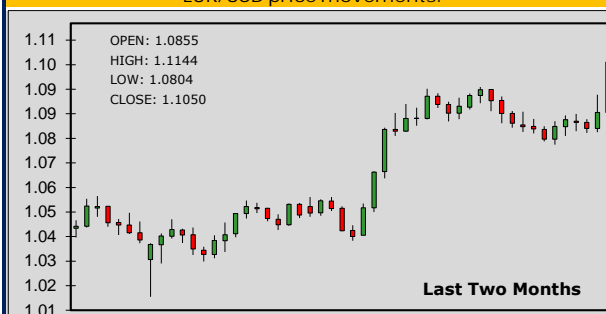
EUR/USD price movements: