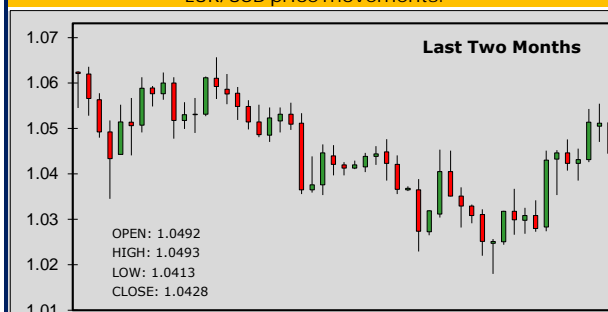
EUR/USD price movements: