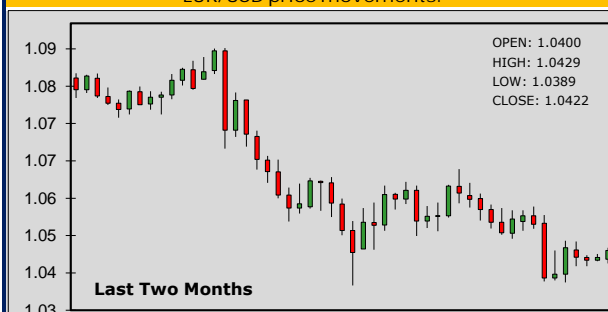
EUR/USD price movements: