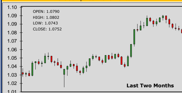
EUR/USD price movements: