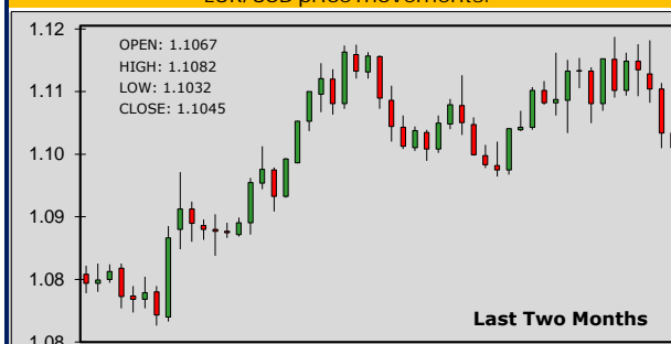
EUR/USD price movements: